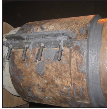
Form was applied