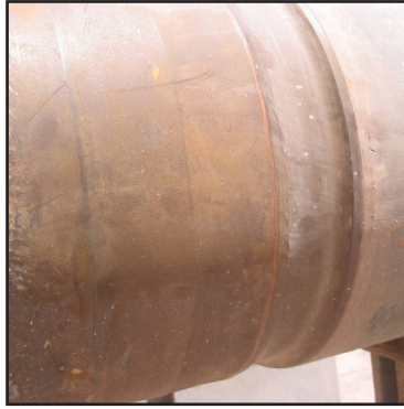
The worn out shaft