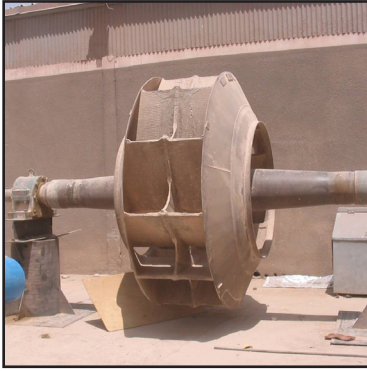
General view of the fan shaft